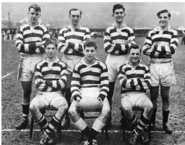
Winners of Ilkley Sevens - 1954

All this kit was kept in lockers in the girls' cloakroom.